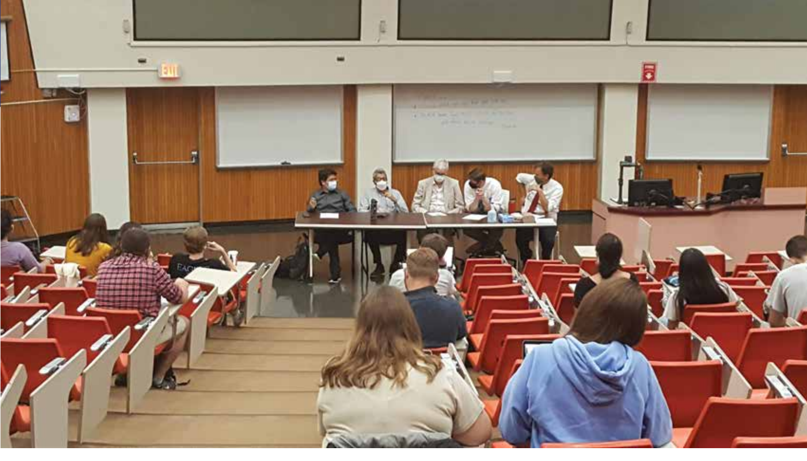
Professors panel discuss US involvement in Afghanistan