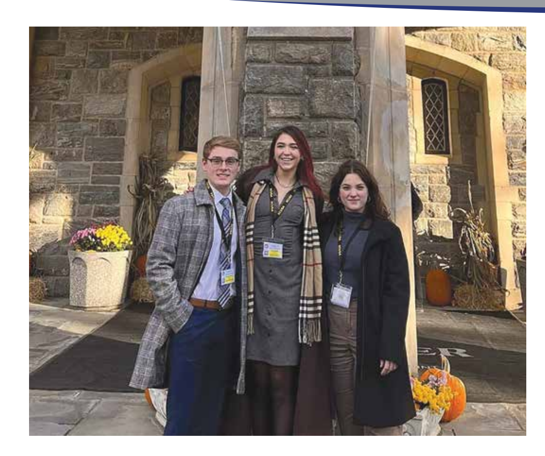
Students at West Point Conference