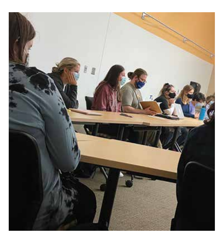
Attendees at Department Lecture